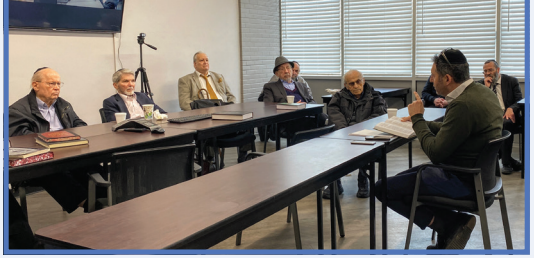
Special presentation from Rabbi Menachem Tend

Partial view of the crowd during Rabbi Winter's presentation